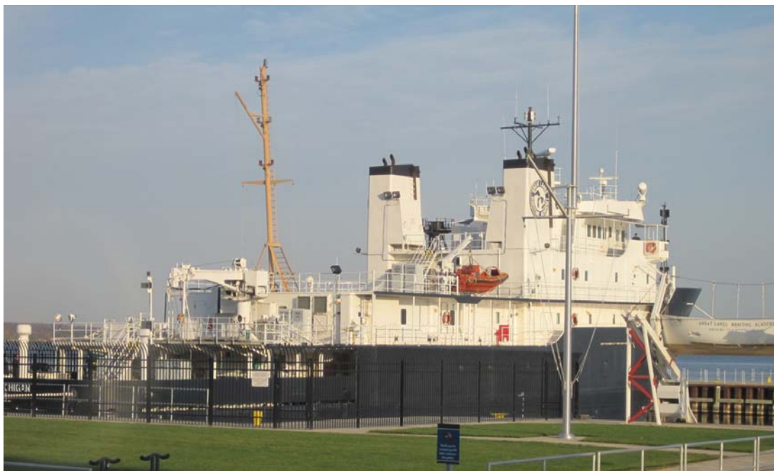
Maritime Academy's teaching vessel at dock