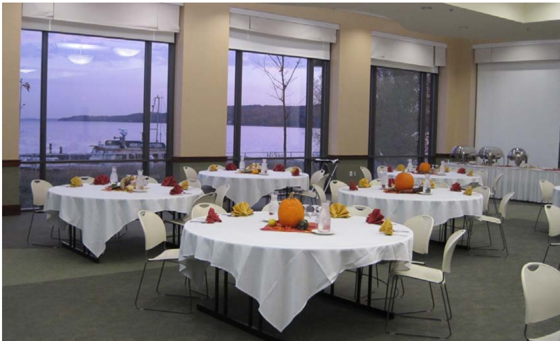
More great food - a hot breakfast buffet sponsored by Wiley Publishing