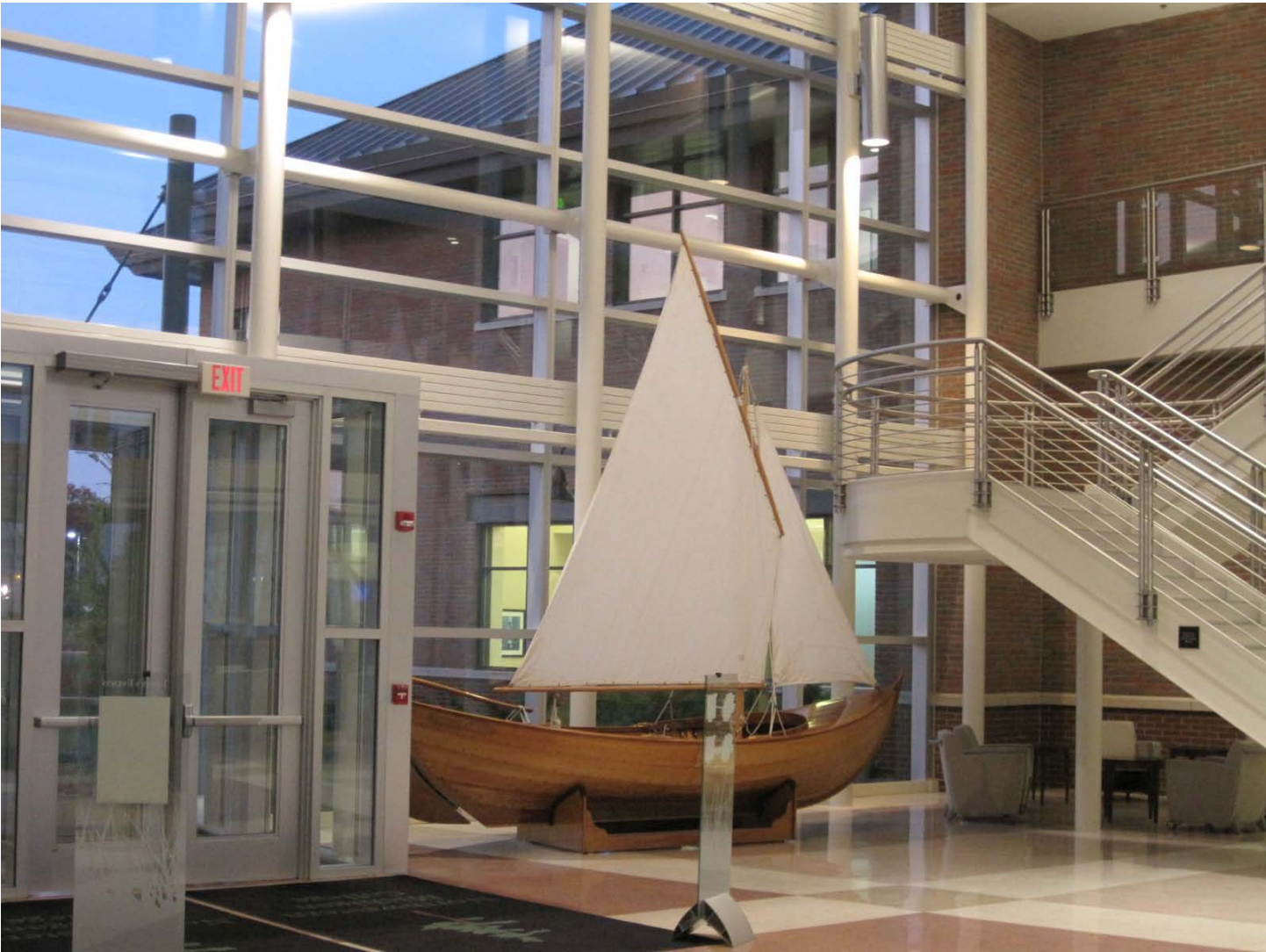
Lobby of the Hagerty Center, on the Great Lakes Campus of NMC ://www.nmc.edu/resources/hagerty-center/index.html