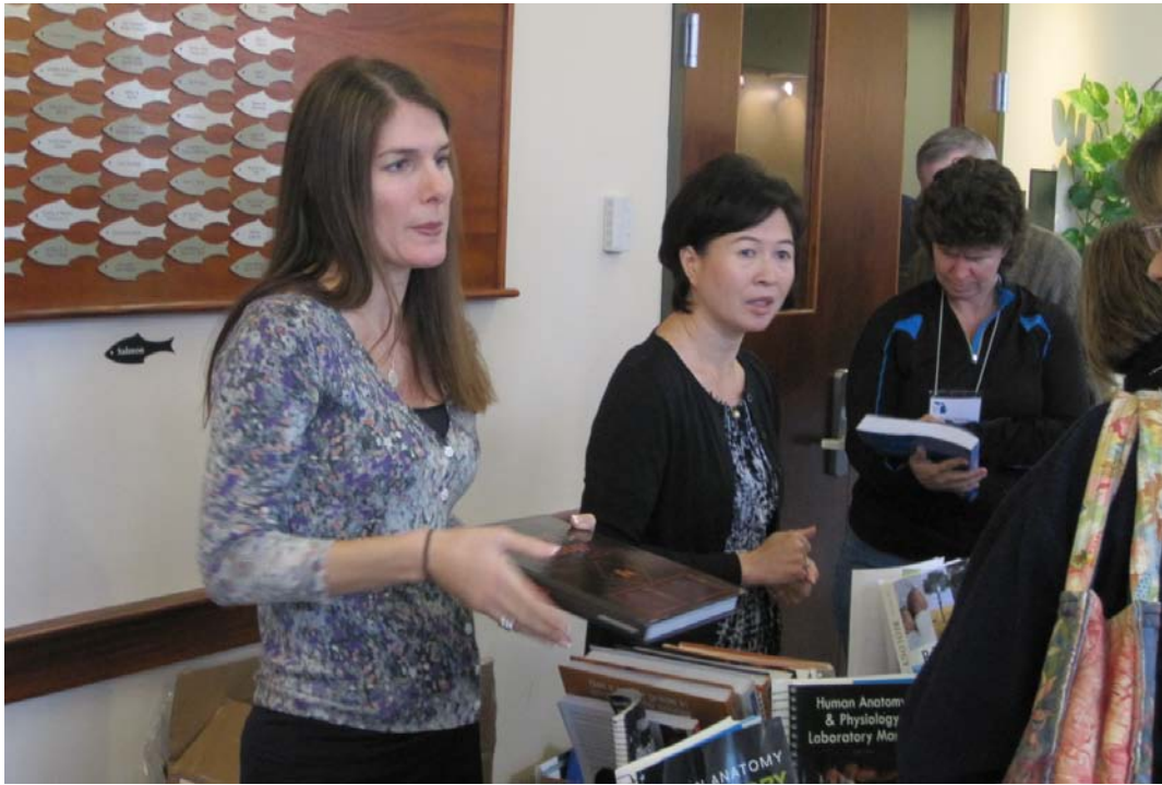
The Pearson Publishing vendors displayed current textbooks & lab manuals