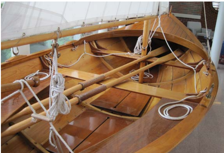
Fine craftsmanship on display