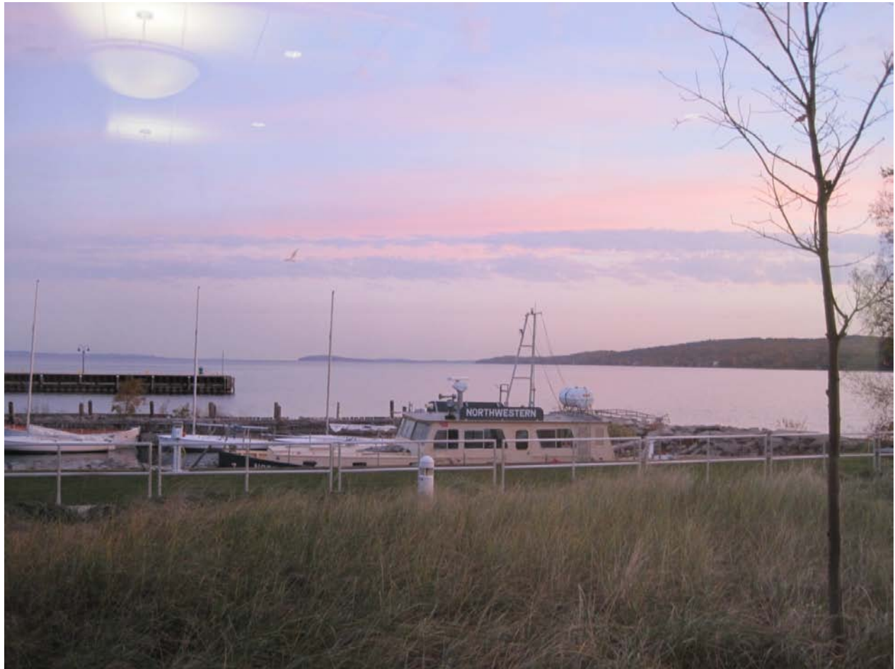
Morning view of Grand Traverse Bay from the dining room