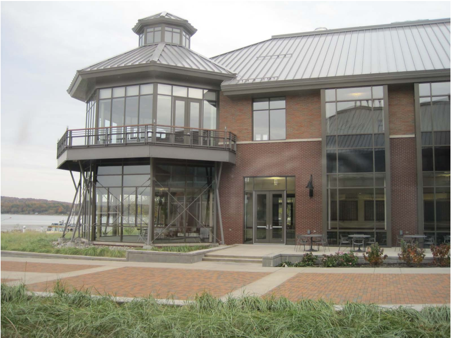
The Great Lakes Campus of Northwestern Michigan College. The MCCB Saturday events were held here in the Hagerty Center, which houses the Maritime Academy, The Water Studies Institute and the Culinary School.