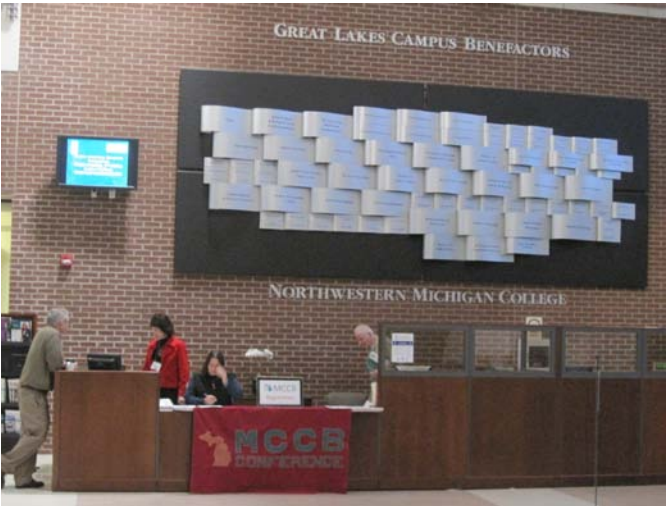
Registration for the Saturday morning arrivals